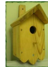
Wren House $11.00