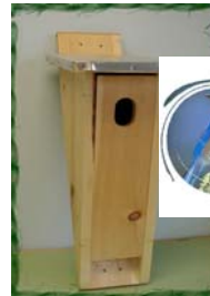
Deluxe Bluebird $16.00