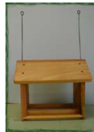
Glass Feeder $19.50