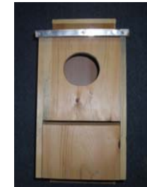
Duck Box $22.00