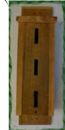
Butterfly Box $16.00