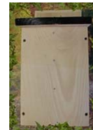
Bat Box $16.00