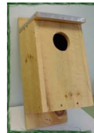
Hawk Nest Box $19.50